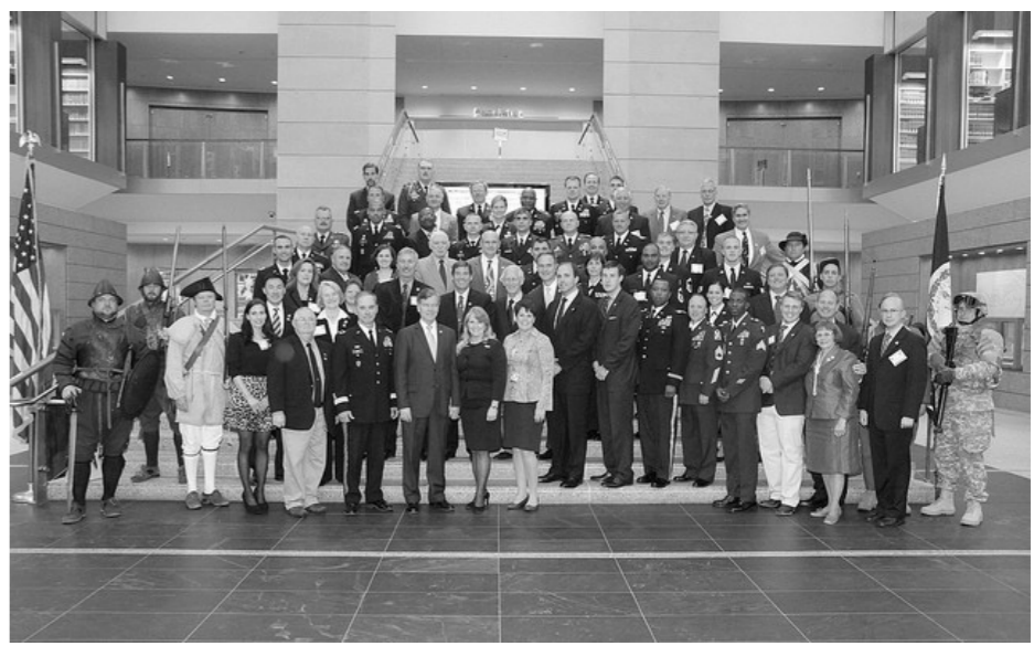
Article and photos from Virginia National Guard Public Affairs Office