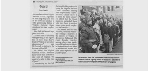
National Guard general warns of dwindling resources (Richmond Times-Dispatch) www2.timesdispatch.com/news/virginia-politics/2012/jan/19...